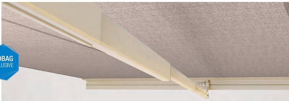
Telescopic arm technology